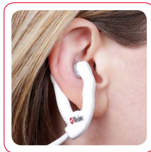
Figure 2. The tip of the E1 sensor is placed on top of the high perfusion area in the Cavum Conchae.